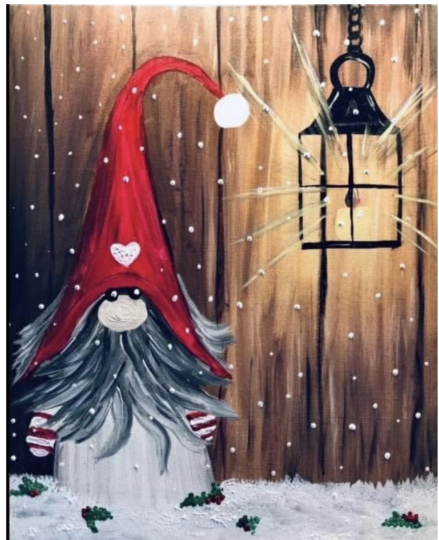
Example of painting

Jericho through messenger or comment below