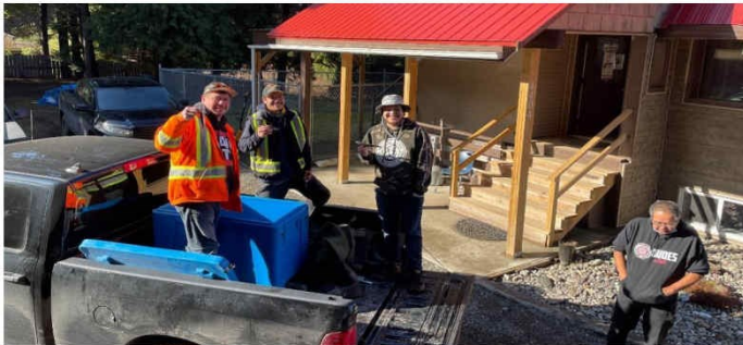
K5T on the way to getting Oolichan