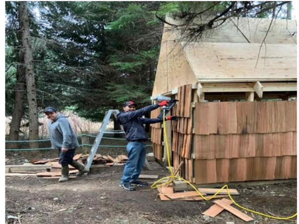
Building of the Smokehouse at K5T