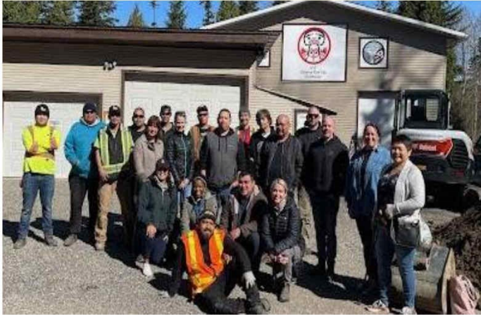
Our employer sponsors, LNGC, came for a project tour and met the students