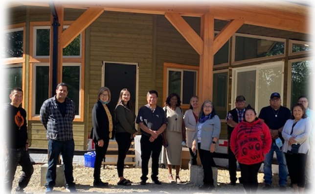
Lighthouse Overview—Chief and Council, NFCIS

to get an idea of what the purpose of our new Light House once it's complete. Also as part of Council's initiatives was to listen to members, and one of those concern's was installing speed signs. These signs can be seen in both Kulspai and Gitaus roads. As part of Council, they wanted to provide the Financial Audited Meeting, to give the opportunity for the community to review and listen to any question's member's asked. Kitselas Annual General Meeting, was a great turn out. We had a lot of feedback forms filled out. The Council also seen the opportunity, to approve the members with a one-time financial payment to all Kitselas Registered Members.